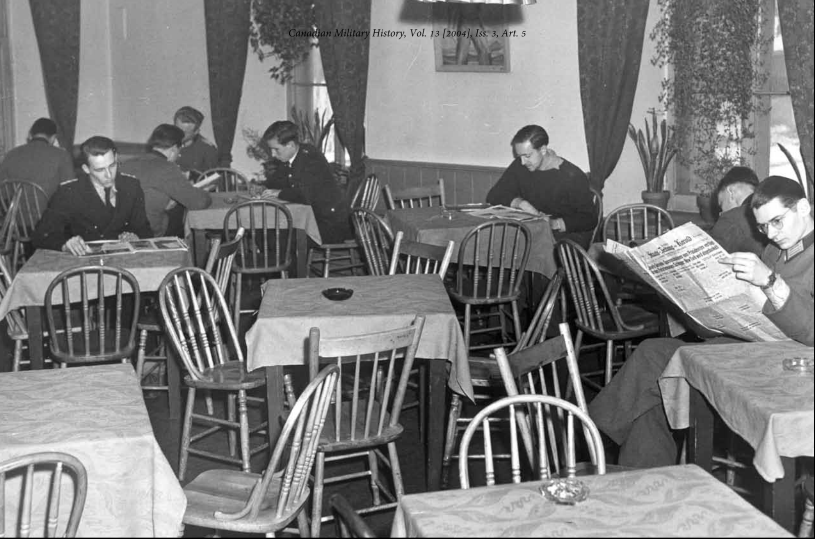
German prisoners of war relax in a reading lounge at Camp Grande Ligne.