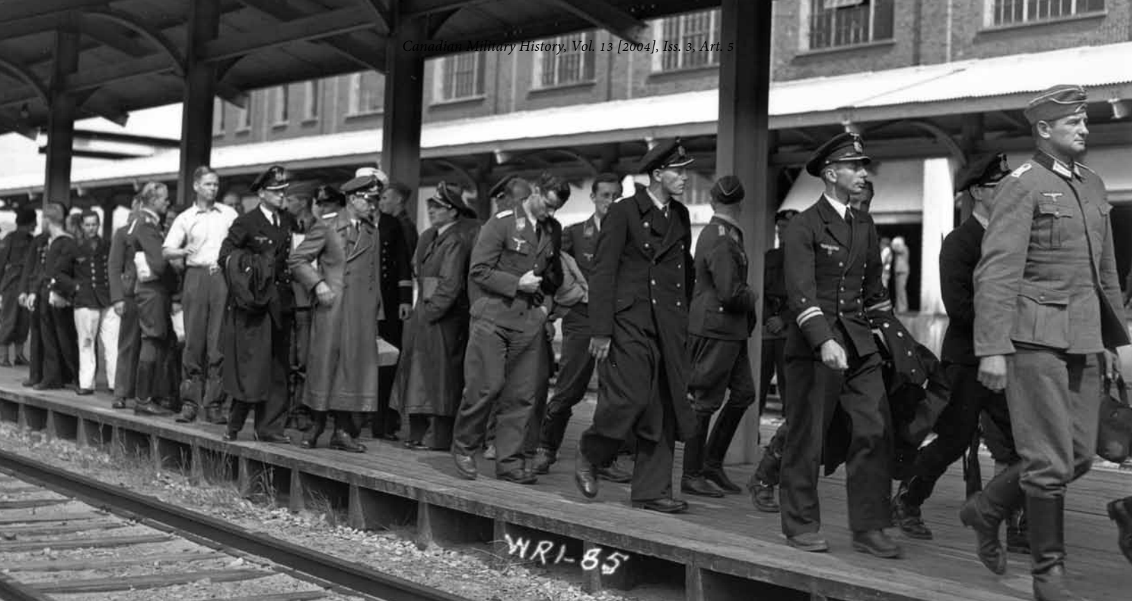
German prisoners of war arrive at the train station in Quebec City, July 1940. This group primarily contains German officers from the Kriegsmarine (navy), Luftwaffe (air force) and Heer (army).

Intelligence section to listen to American, British, Canadian, and even German radio broadcasts and to remain abreast of international events. The inmates also attempted on several occasions to use the camp mail system to transmit valuable information to Nazi Germany. To avoid detection by Canadian censors, letters were encoded or written in various types of 'invisible inks' made from milk, oranges, potatoes, urine, and other natural products. 20 Furthermore, the intelligence section kept detailed records of the movements of camp guards and the number of trains arriving at the local railway station. 21