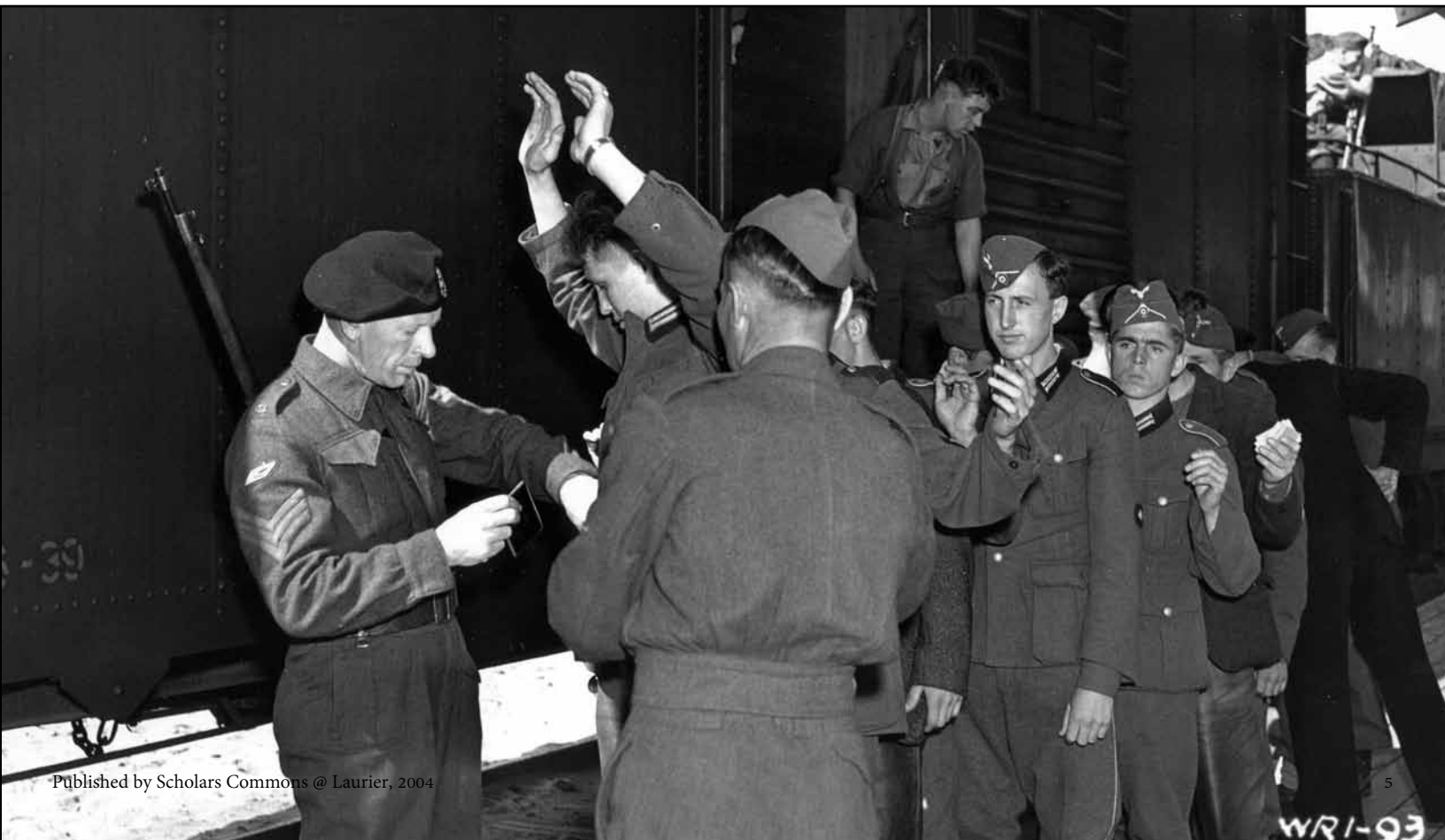
German POWs are searched upon their arrival at the train station in Quebec City, July 1940.

Nothing reflected more on the dominance of Nazism at Grande Ligne than the establishment of the HARIKARI Club. The D-Day landings of 6 June 1944 had a tremendous impact on the POWs. The realization that Allied military forces might soon crush Nazi Germany, combined with feelings of anger and uselessness, incited the Nazis to become more ruthless and rabid. 30 The HARIKARI Club was created in the early summer of 1944 by some of these POW as a means of continuing the war behind Canadian barbed wire. Although not much is known about the roots of this secret organization, we do know that it operated under the chairmanship of three