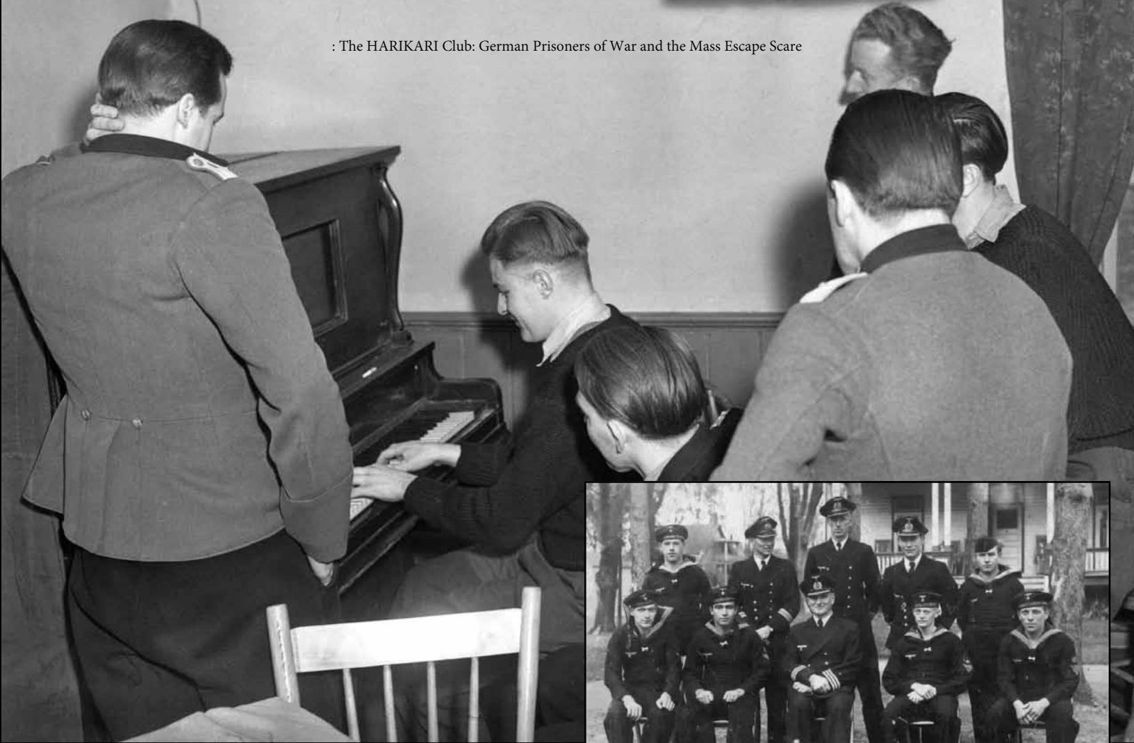
Above: German prisoners gather around a piano at Camp Grande Ligne. Right: Crew members of the German submarine U-35 at Camp Grande Ligne, 1944.